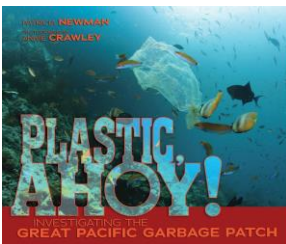
Plastic Ahoy! – About the Great Pacific Garbage Patch

Books for Babes is a literacy project initiated by the Delta Kappa Gamma Society, a group of key educators in the area. Each month, this community outreach project distributes about 500 "baby's first books" to parents of newborns in three major hospitals in San Joaquin County: St. Joseph's Medical Center, San Joaquin General Hospital, and Lodi Memorial.