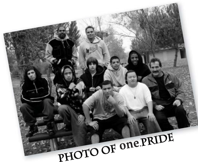
PHOTO OF one. PRIDE

For more information about Alternative Education, one. , visit www.sjcoe.org/alted .