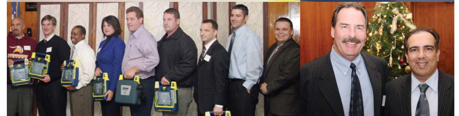
Administrators and coaches from Stockton and Elk Grove high schools receive Automated External Defibrillators (AED), a life saving device for Sudden Cardiac Arrest, from Dameron Hospital.